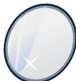
Permanent IR Windows (Various types available)