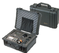
Pelican Carrying Case