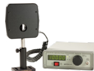
SDC-500 Digital Optical Chopper